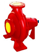
B&G Series e-1510 back pull out End Suction-Top Discharge