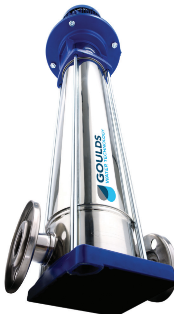
Goulds e-SV Series