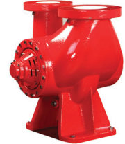
B&G Series VSX-VSC Split Case Top Suction-Top Discharge