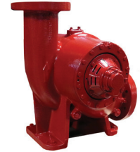
B&G Series VSX-VSCS Split Case Side Suction-Top Discharge