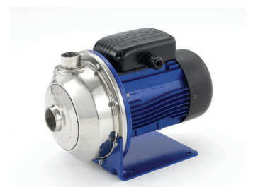
Goulds CEA Series