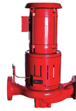
B&G Series 80-SC Split Coupled Inline