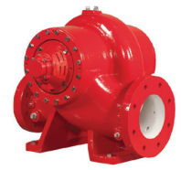
B&G Series VSX-VSH Split Case Side Suction-Side Discharge