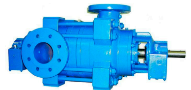
Goulds e-MP Series