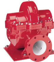
B&G Series HSC3 Horizontal Split Case Double Suction