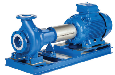
Goulds e-NSC Series